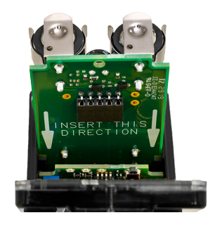
Figure 1. Q45 battery board

As with all batteries, these are a fire, explosion, and severe burn hazard. Do not burn or expose them to high temperatures. Do not recharge, crush, disassemble, or expose the contents to water. Properly dispose of used batteries according to local regulations by taking it to a hazardous waste collection site, an e-waste disposal center, or other facility qualified to accept lithium batteries.